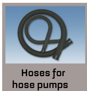
Hoses for hose pumps