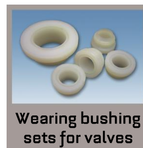
Wearing bushing sets for valves

Information without engagement. All rights to changes without prior notice reserved.