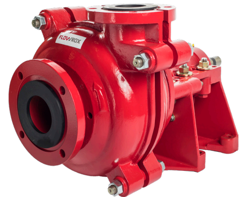
Flowrox CF-S centrifugal pump is fit for various pumping applications of corrosive and abrasive slurries.

The pump handles lower flows 2.3 m 3 /h through excess of 4 000 m 3 /h. A single Flowrox CF-S centrifugal pump can reach heads higher than 76 m and has a good ratio between efficiency and wear. The construction of the Flowrox CF-S pump is based on split-case and it includes a range of liner material options for optimal performance.