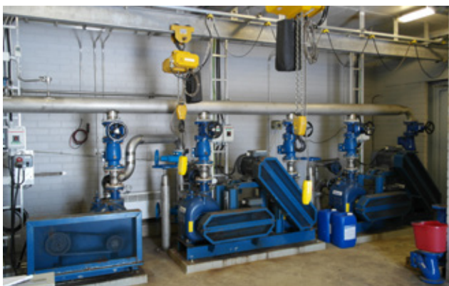
EKJH pump station and remote view in Flowrox Malibu.

“We chose Flowrox because they offered us the best service,” says Sami Huotari, Site Manager at EKJH. They have continuous support from Flowrox professionals even after installations. Flowrox solution is saving EKJH lots of valuable time, has significantly increased safety and optimised operation of pump station.