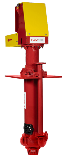
Flowrox centrifugal pump CF-V is fit for various pumping applications of corrosive and abrasive slurries.

The pump handles flow rates through 1 135 m 3 /h. A single Flowrox CF-V pump can reach heads up to 50 m and cantilevered depth to 3.6 m with suction extension pipe. Wet parts are either elastomer or hi-chrome and designed for ease of maintenance to minimize downtime.