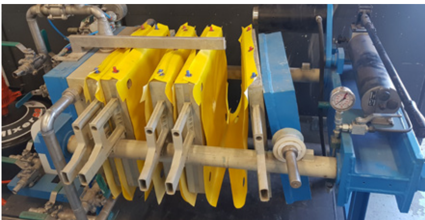
Filter press test unit simulates the operation of the full-size industrial filter.