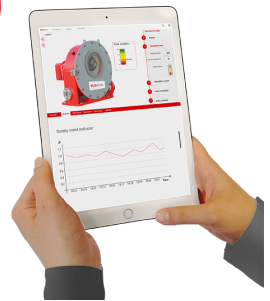
Malibu™ portal is user-friendly and easy to navigate.