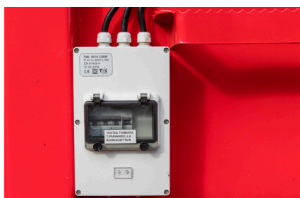
The GeoBox™ units can be isolated and heated for areas with colder climates.