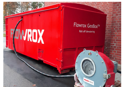
Flowrox GeoBox™ roll-off unit saves water and makes transport of waste much easier.

Geotextile filtration can remarkably reduce the costs related to waste handling. Depending on the quality of the sludge you can remove up to 90 % of water. To avoid major investments, we can also provide full operative service based on monthly or handling fee.