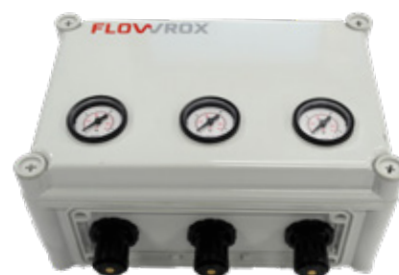
Compact control unit enables exact system management.