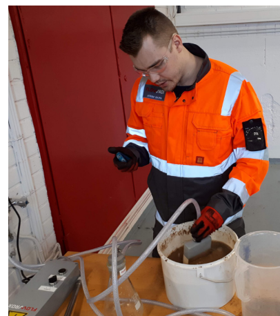
Simple ceramic dip test set fits in a smaller suitcase and requires little space.