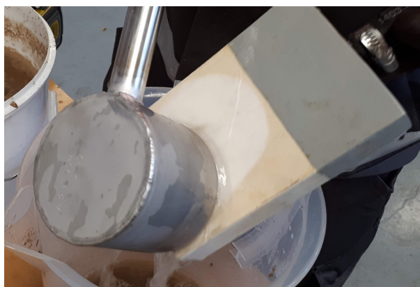
The ceramic disc test unit can also simulate the ultrasonic washing cycle just like the full-size industrial filter