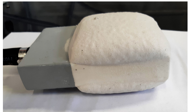
Ceramic plate before (left) and after (right) cake formation. The test simulates the operation of the full-size industrial filter.