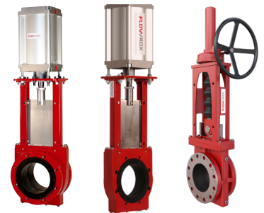
Flowrox Slurry Knife Gate Valves