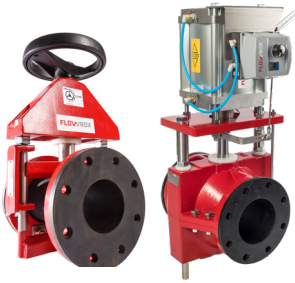
Flowrox PV and PVE Pinch Valves