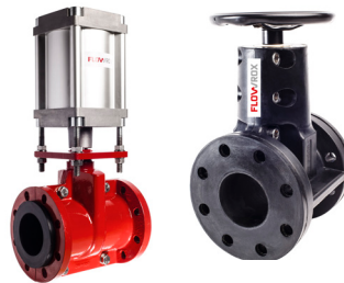
Flowrox PVG and PVEG Pinch Valves