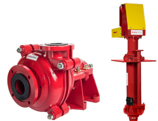
Flowrox Centrifugal Pumps